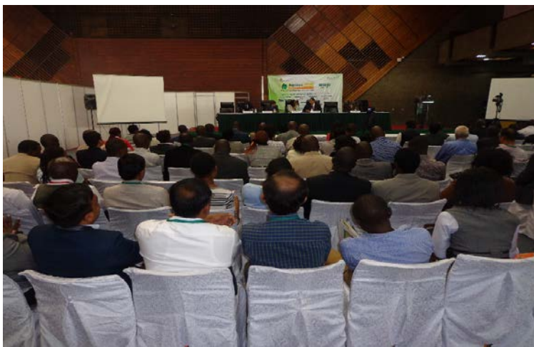
Two days Technical Conference during Agritec Africa 2015.