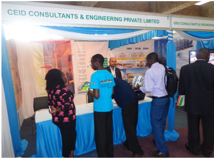
Visitors at CEID Consultants & Engineering Pvt. Ltd's stall during Agritec Africa 2015