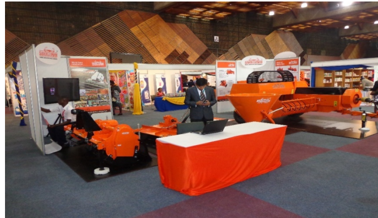
Stall of Tirth Agro Technology Pvt. Ltd. during Agritec Africa 2015