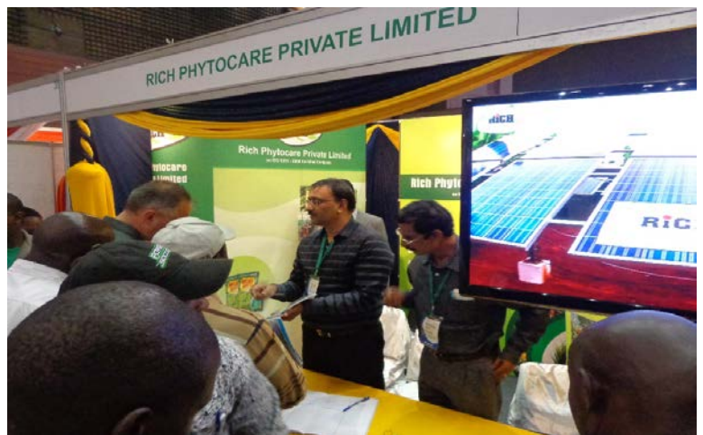
MD of Rich Phytocare Pvt. Ltd. is explaining visitors about their Solar Panels operated Pumps. They have also put the demo model for their solar driven pump.