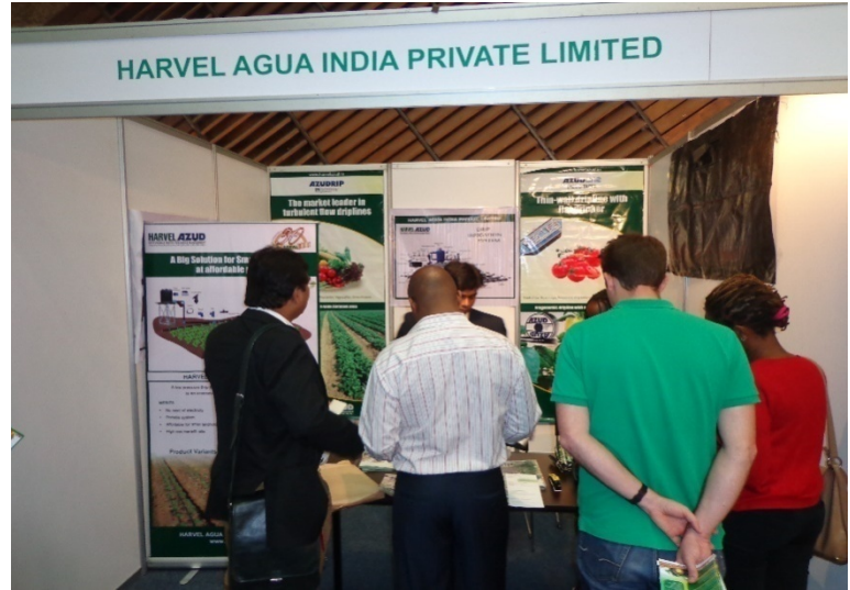
Visitors at Harvel Agua India Pvt. Ltd.'s stall during Agritec Africa 2015