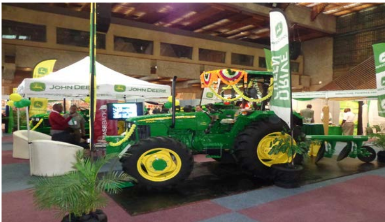
Stall of John Deere during Agritec Africa 2015