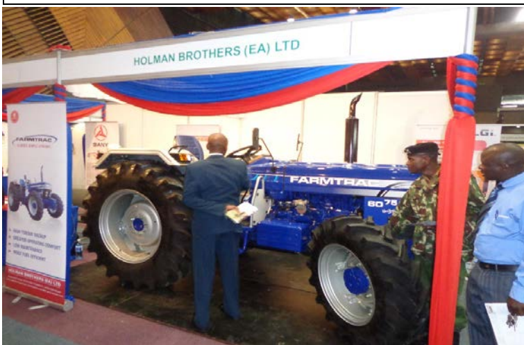
Stall of Holman Brothers (EA) Ltd.- Escorts Tractors during Agritec Africa 2015