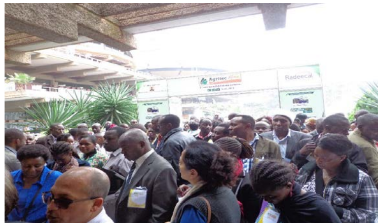
Visitors gathered at the time of inauguration to get entry for Agritec Africa 2015 near Tsavo Entry gate of KICC.