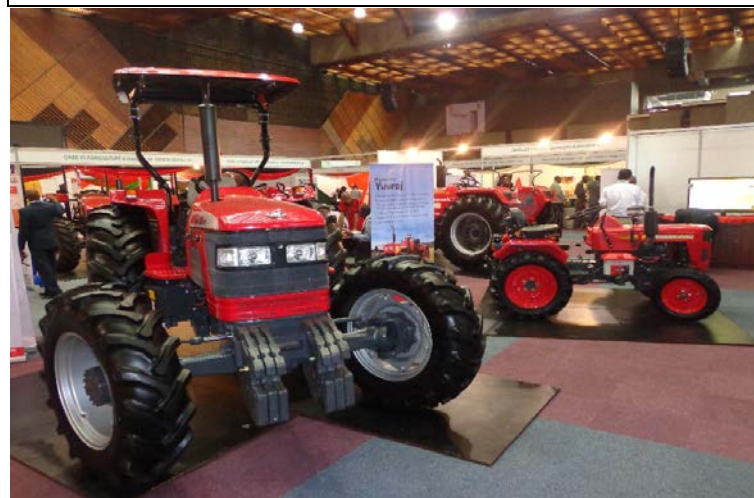
Stall of Timsales Ltd. – Mahindra Tractors during Agritec Africa @015